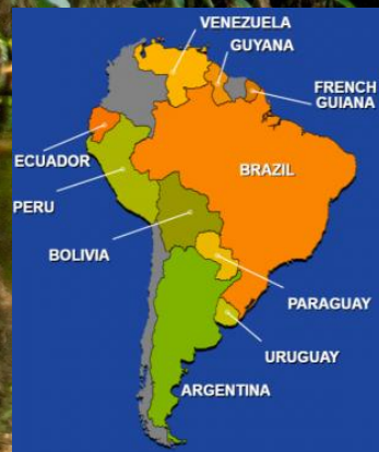
South America (continent)