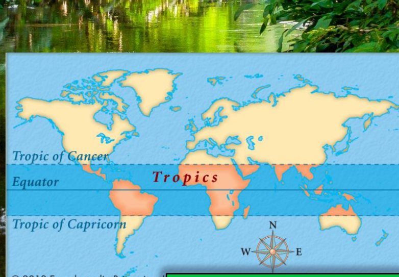
Equator and Tropics