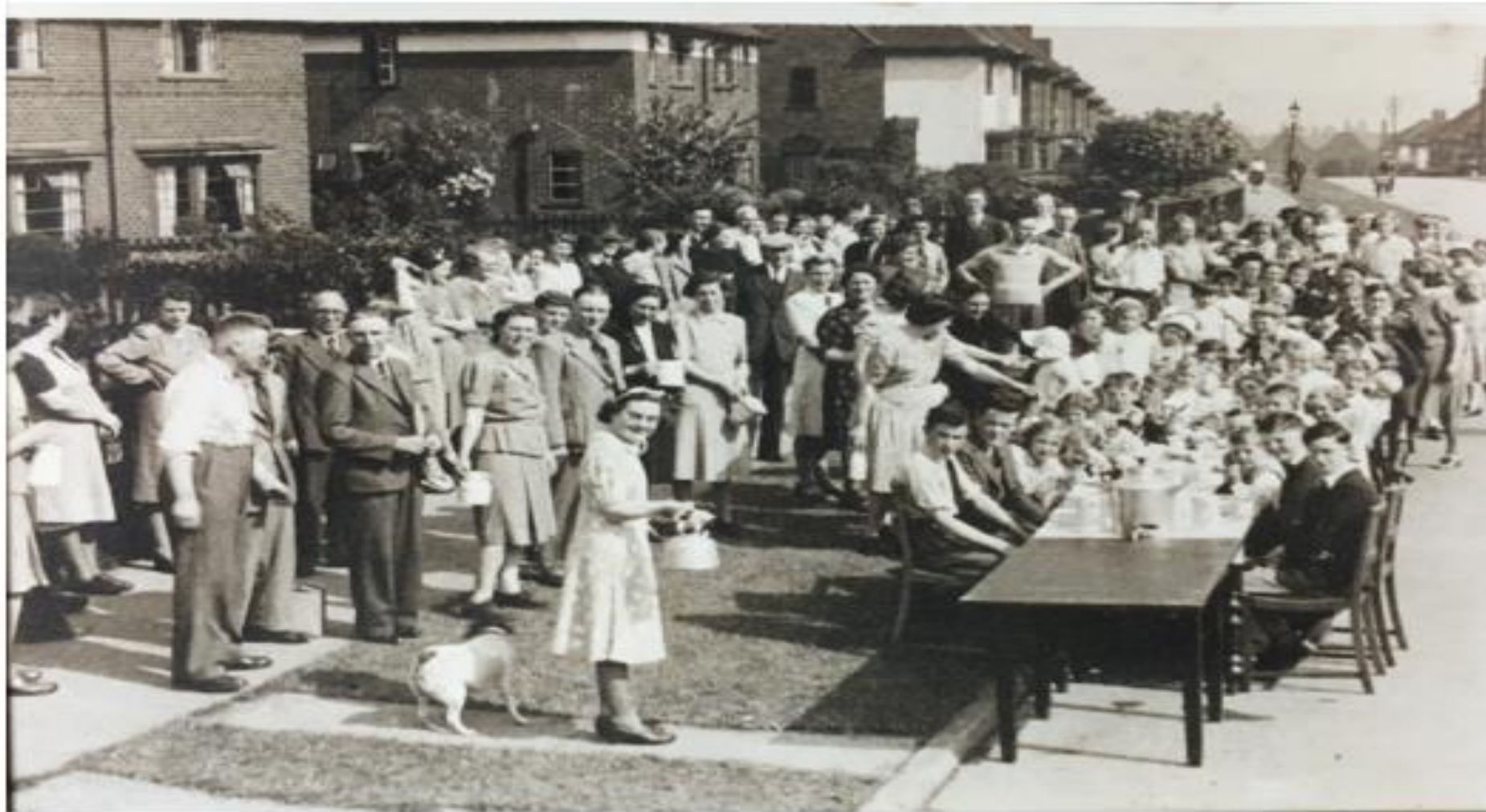
Street Party, Long Hill Rise, Hucknall