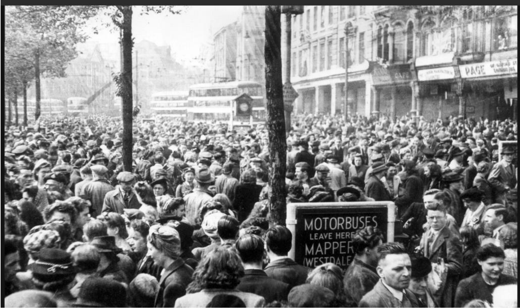
Market Square, Nottingham 1945