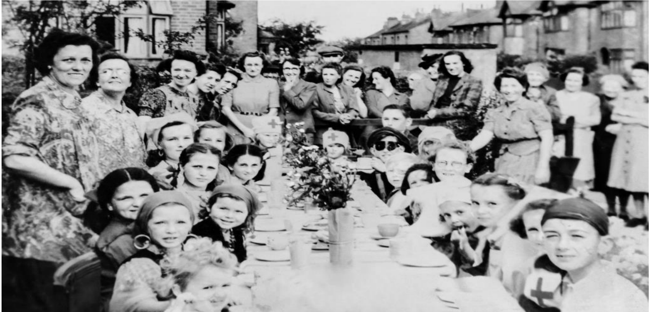
Street Party, Carlton, Nottingham 1945