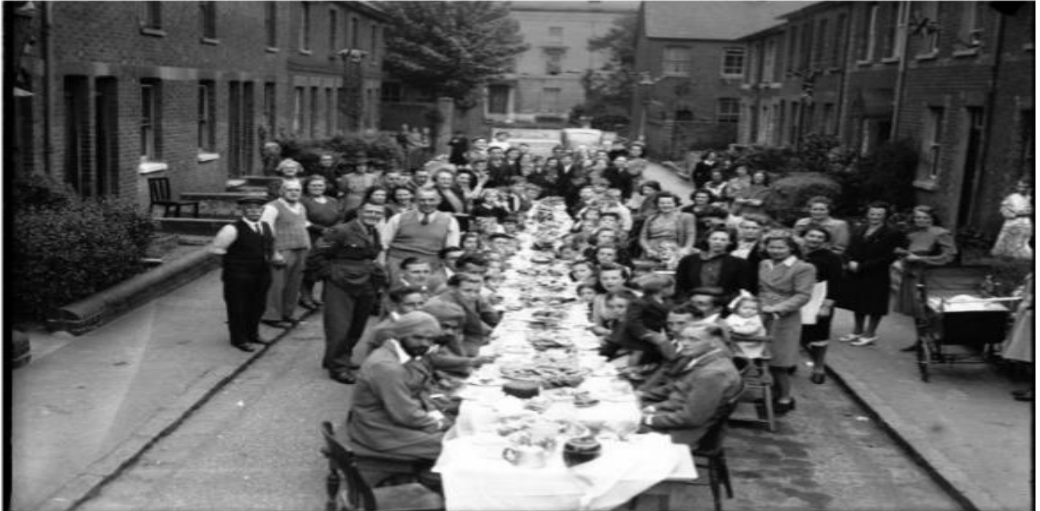
A street party in Reading